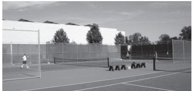
Tennis enthusiasts are thrilled with the new tennis courts, located next to Yolo Hall.