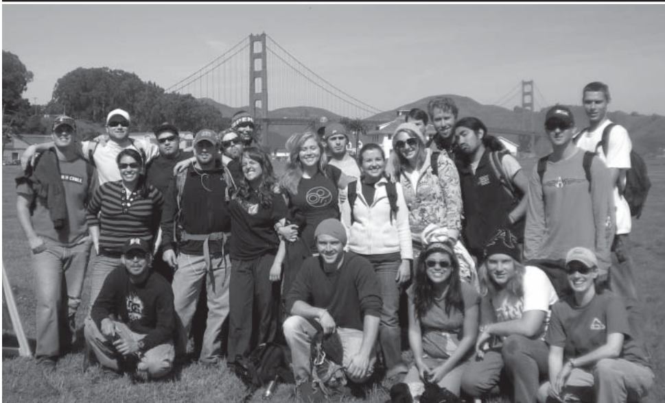
Students learn about the urban-park interface through the alternative spring break service learning course