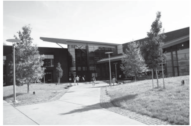
Students enjoy opportunities for sport and fitness at the Wildcat Recreation Center.