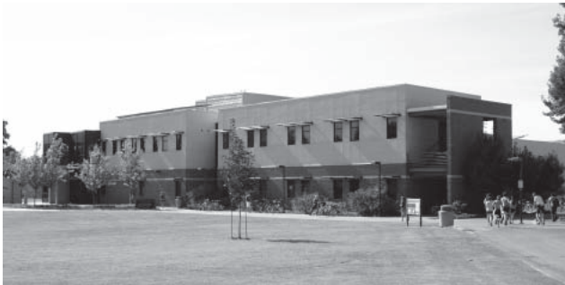
Yolo Hall is home to the Department of Recreation and Parks Management.