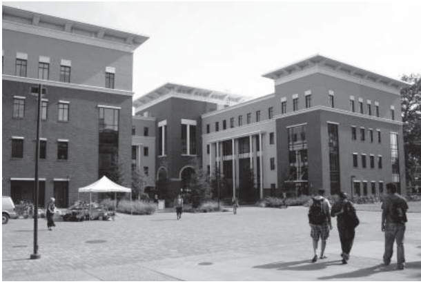
New Student Services building, located by the BMU, adds convenience and atmosphere.